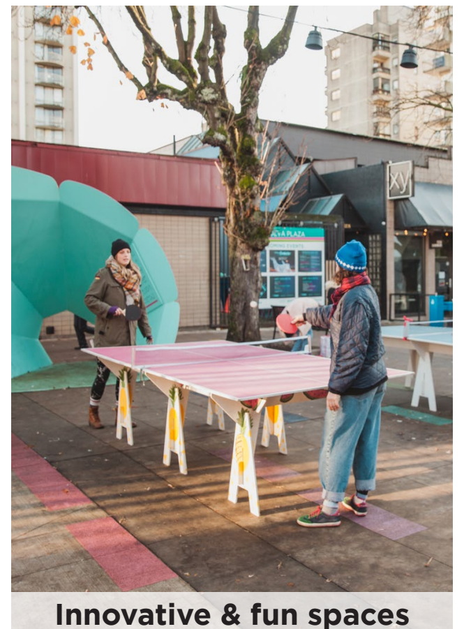
Innovative & fun spaces

For more information visit vancouver.ca/bute-greenway