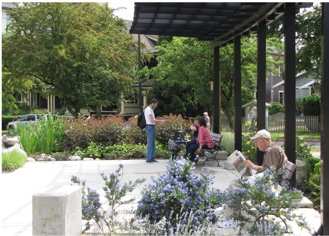
Should create a welcoming space with opportunities for people to gather, hold community events, socialize and connect with each other