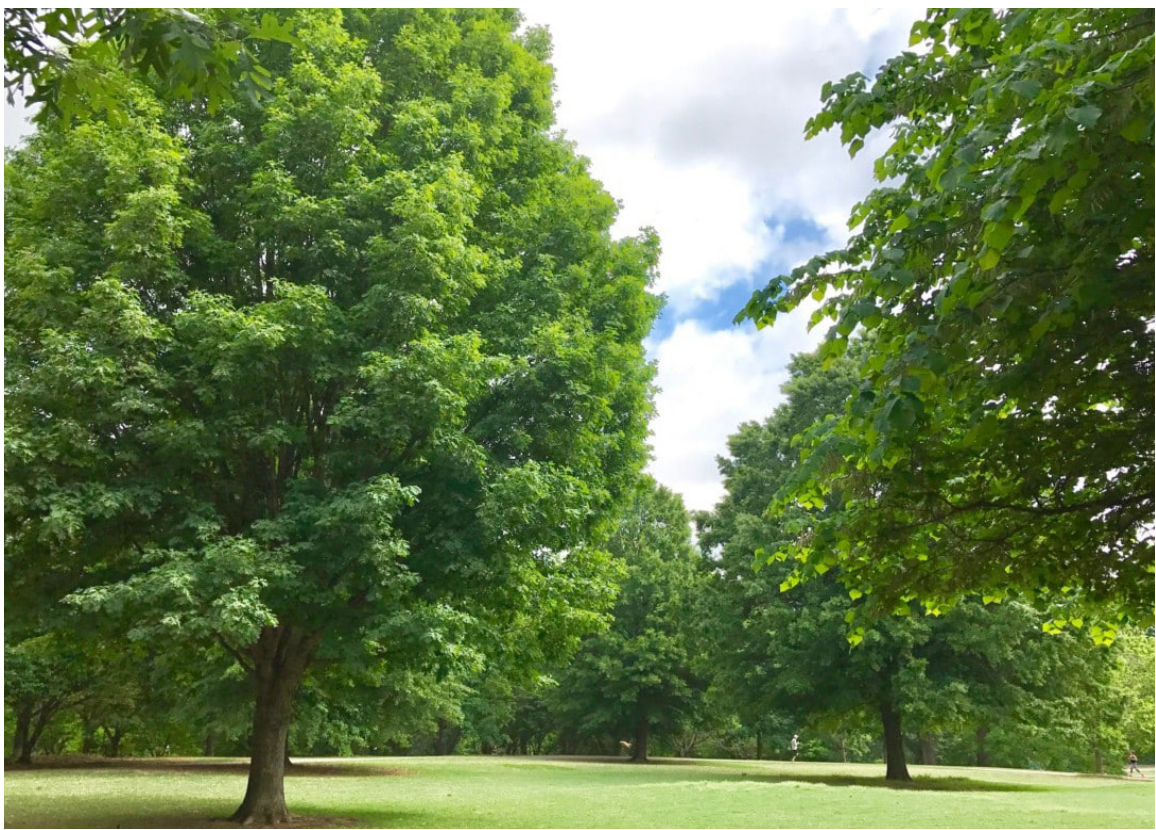
Should contribute to a healthy environment with a focus on increasing the tree canopy and adding natural areas that support birds, pollinators and wildlife