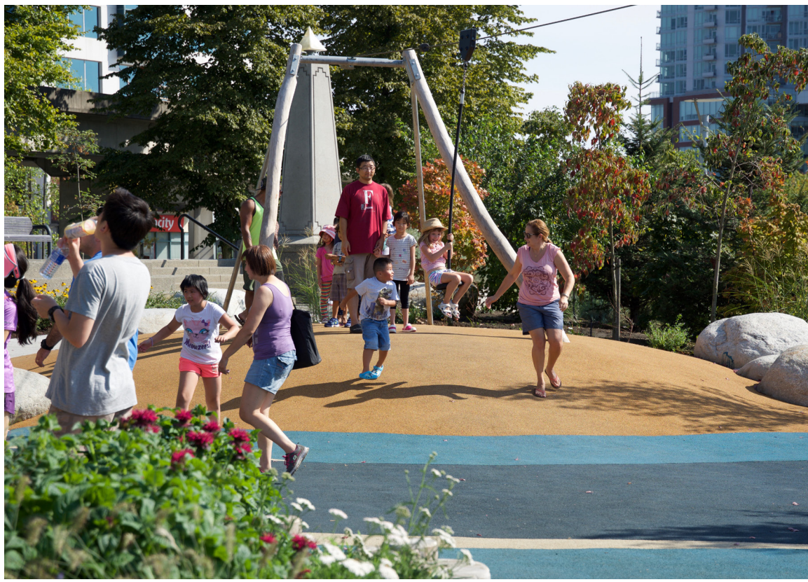
Should create an inviting and playful space for children of all ages and abilities with a range of options for play