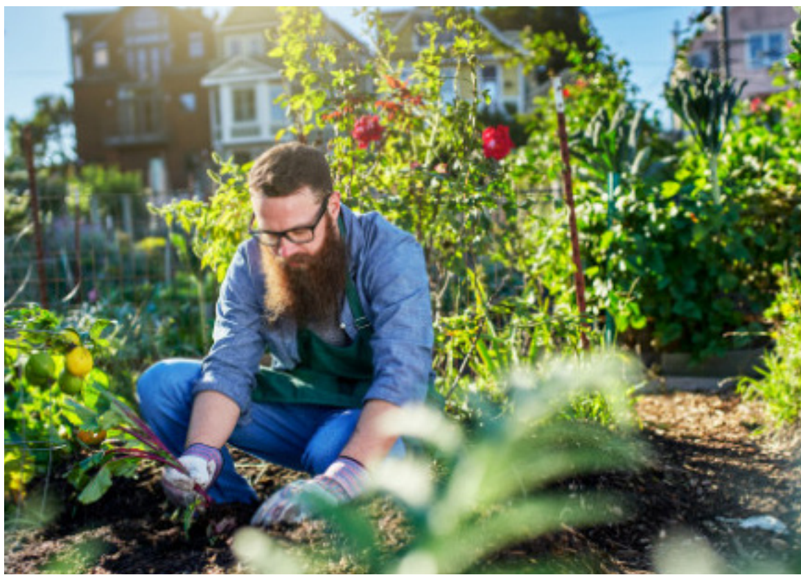
Should contribute to local food production