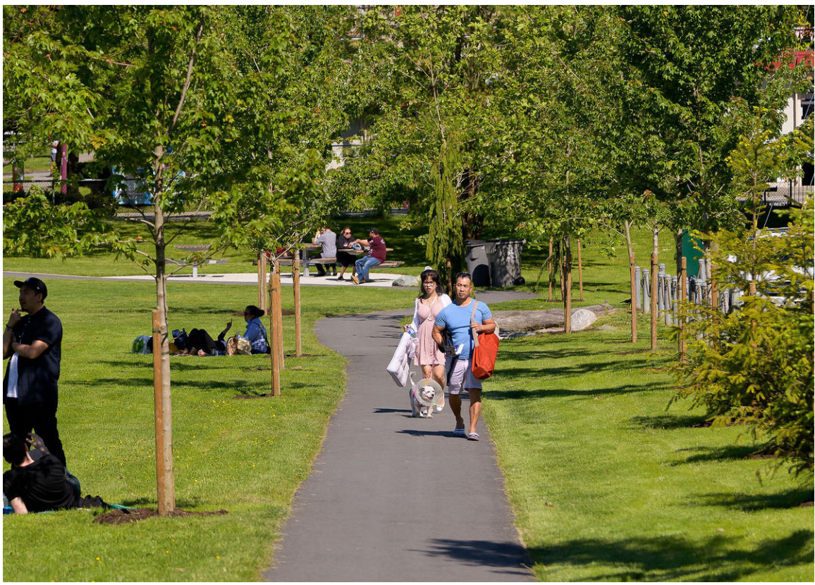
Should make park elements more accessible, providing a new pathway or loop through the park that could be used for walking, jogging, rolling