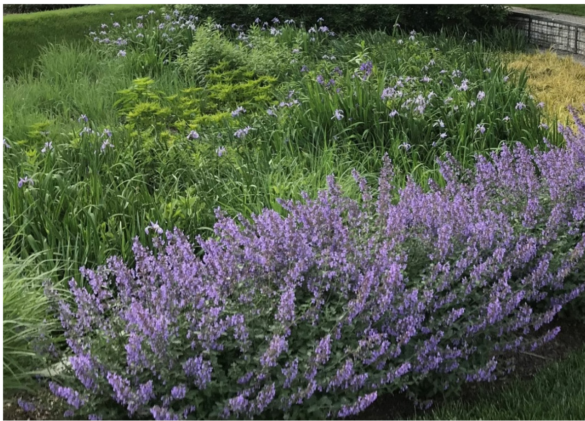
Should improve drainage and water quality that flows from the park with green infrastructure, such as rain gardens, to capture and clean rainwater