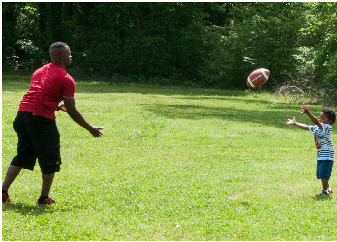
Should contribute to an active and healthy neighbourhood with spaces for sports, fitness, and recreation