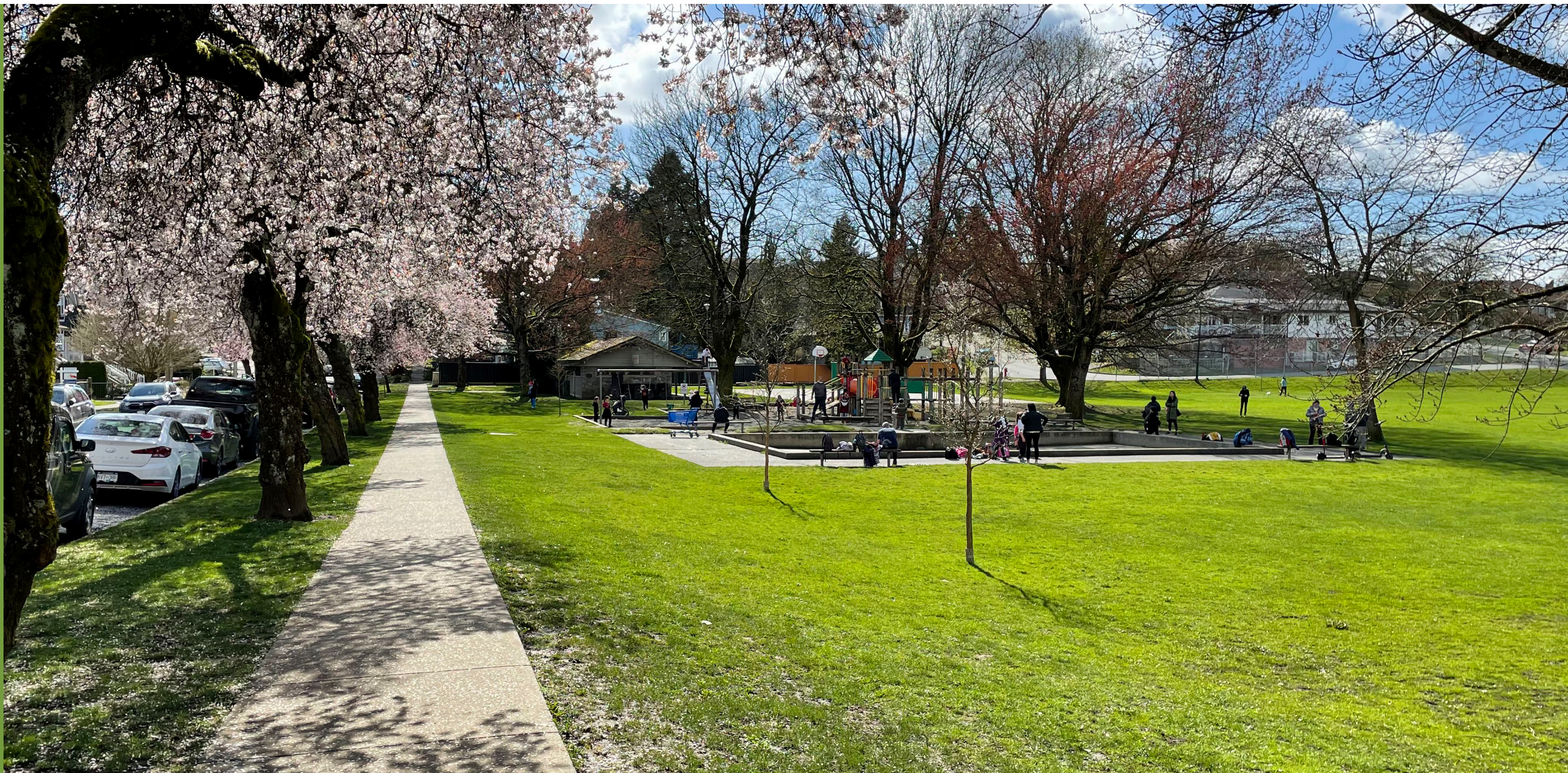
View of the playground and wading pool at Collingwood Park