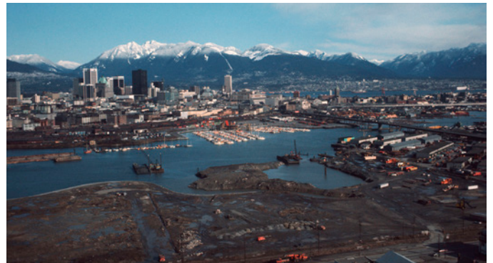
False Creek South pre-development (1970s, looking northwest)

When this neighbourhood was first built in the 1970s and 1980s, much of the land was leased by the City to tenants via 60-year leases, with most of these leases expiring in the next 15 to 25 years. No new housing has been built in False Creek South since the 1980s.