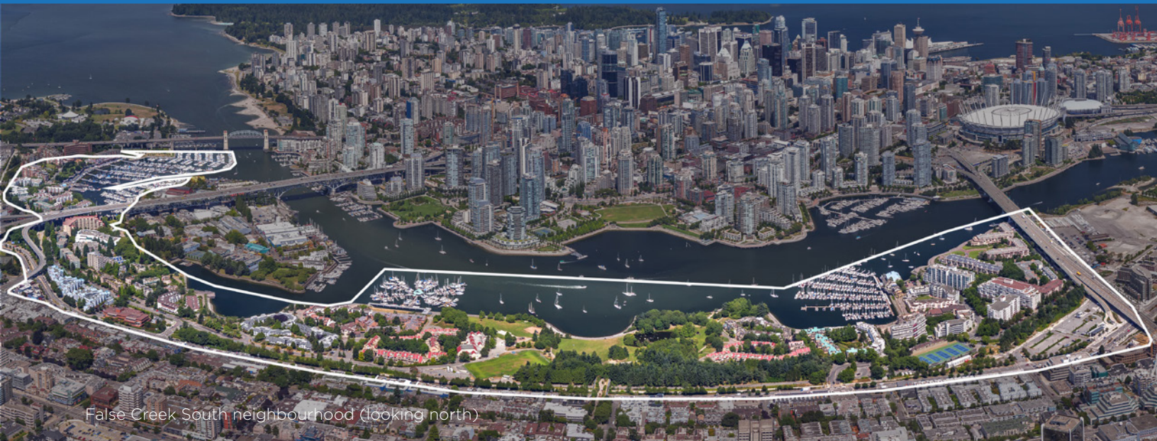
False Creek South neighbourhood (looking north)