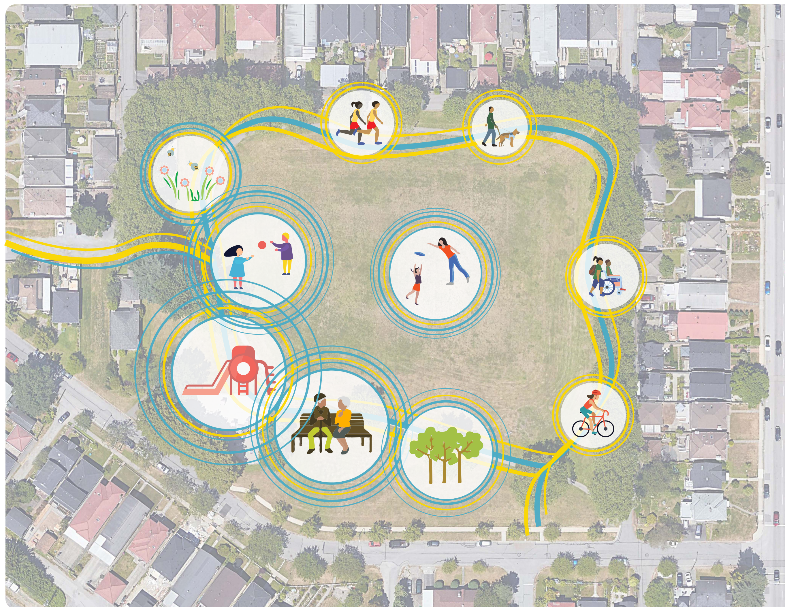
Proposed activities in General Brock Park

The aim of the park renewal is to provide more opportunities to sit and gather throughout the year, play, be active, enjoy nature, and bring the whole family to the neighbourhood backyard!