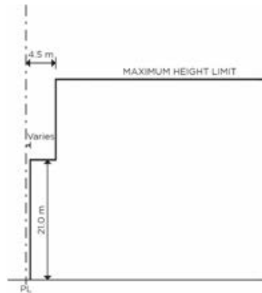
Diagram: Building Heights for Building Portions Along 2nd, 3rd and 4th Avenues